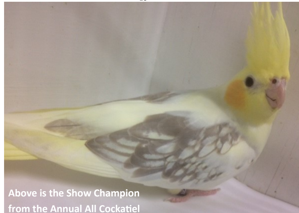
Above is the Show Champion from the Annual All Cockatiel