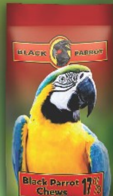
Black Parrot Chews 17