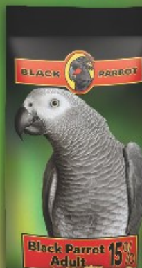
Black Parrot Adult 15