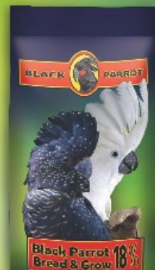
Black Parrot Breed & Grow 18